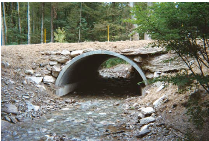
The new, open bottom culvert over Benedict Brook at River Road is designed to allow fish passage.