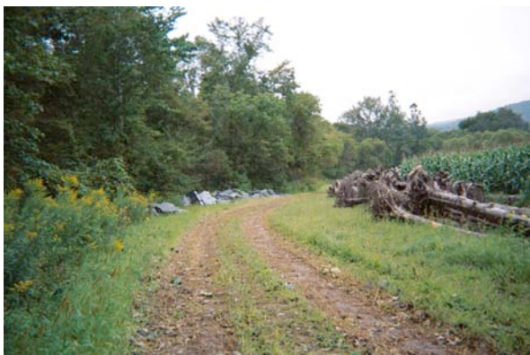
Sticks and Stones

Staff from Green Mountain National Forest and the Vermont Fish & Wildlife Department worked with equipment and operators from Dydo and Company of Dorset to create cover and shelter for the trout in the upstream section of the project. The structures can best be viewed from the base of the long hill between Benedict Crossing and the Covered Bridge on River Road in West Arlington. The difference between the amount of cover and shelter now in the project area and the absence of cover outside of it is quite striking. The structures make use of existing features: for instance, at a big overhanging sycamore, three tree rootwads and a log are clustered together and anchored into the bank.