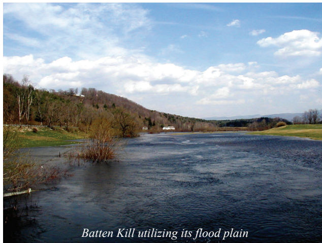
Batten Kill utilizing its flood plain

Fortunately, restoration of a riparian buffer is a fairly simple process. The easiest, but slowest, method of restoration is simply moving the impact (possibly a tilled field or trail) away from the stream and allowing the area to naturally revegetate. Over several years, a mix of grasses, trees, and shrubs will establish themselves. A more effective restoration process involves the active planting of native riparian species, such as red-osier dogwood, willow, fern, maple, and birch.