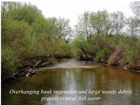
Overhanging bank vegetation and large woody debris provide critical fish cover

Reach 2 measures 1.7 miles in length. Within the reach, a total of 21 habitat units were identified of