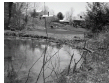
volunteers and plants